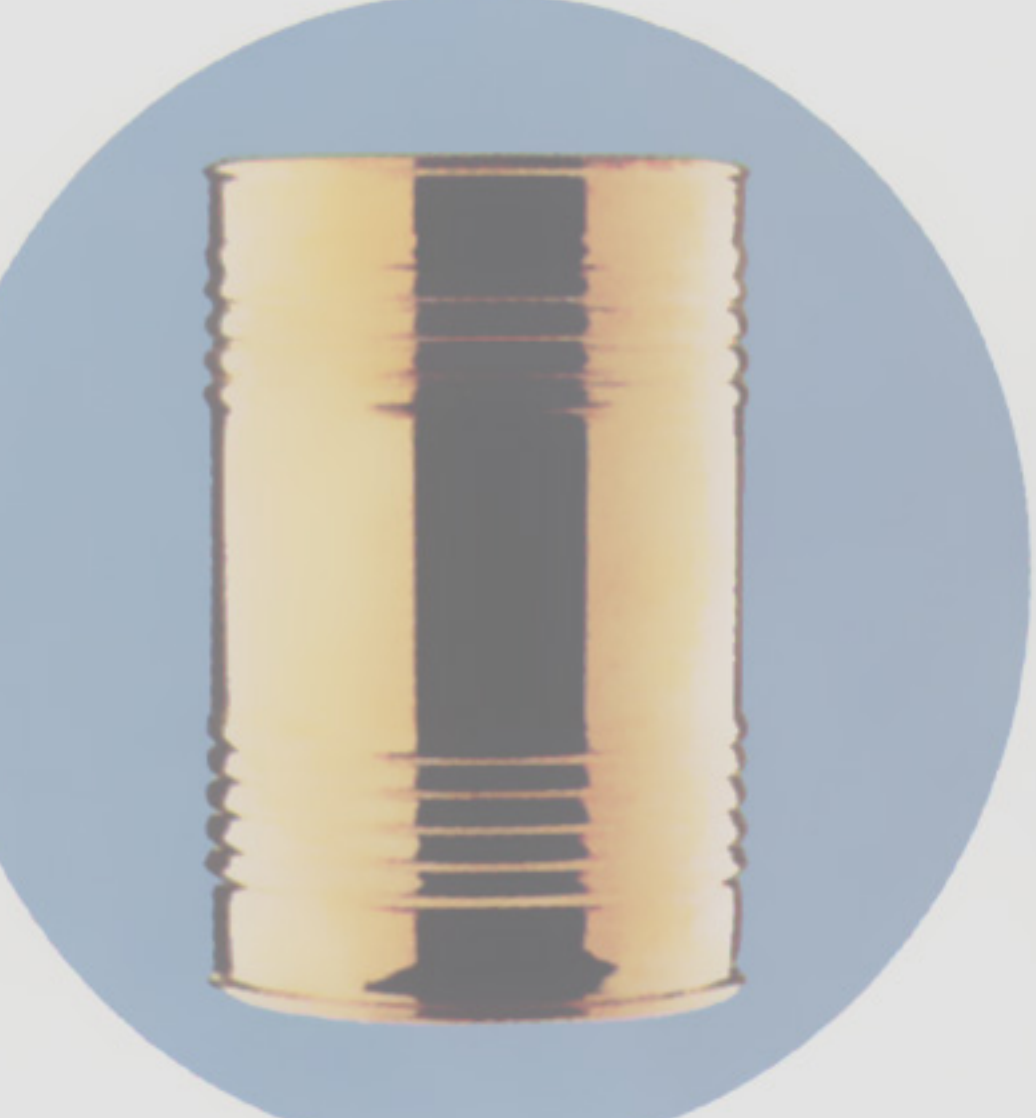
Gold Can Vase, $39, conranusa.com