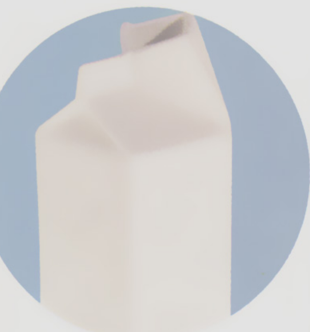
Porcelain Milk Container Creamer, from Seletti's Daily Aesthetics collection, $20, lekkerhome.com