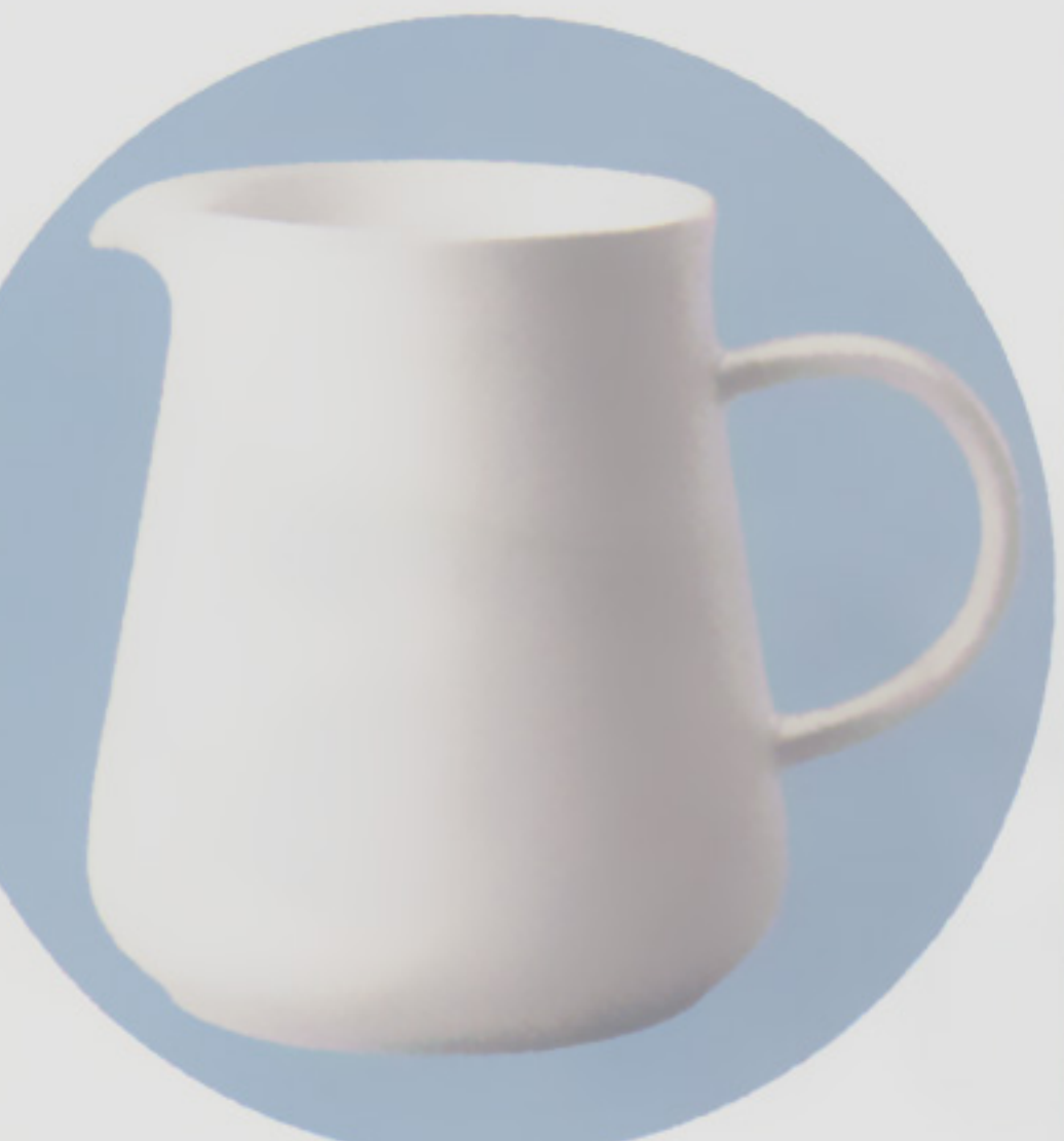
Five Senses pitcher, large, $41, lekkerhome.com

Get the look from our flower story with these found-object vessels