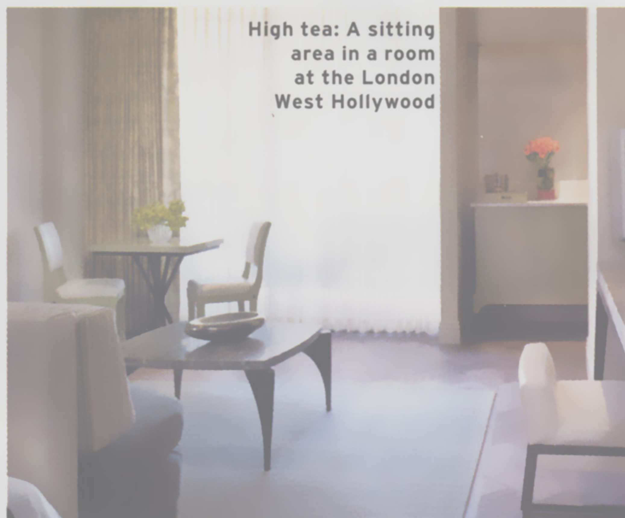
High tea: A sitting area in a room at the London West Hollywood